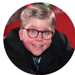
A CHRISTMAS STORY

Saturdays, 11:00 am Adults $5 Children $4 Complete schedule at BrynMawrFilm.org .