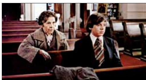
Harold and Maude (1971)