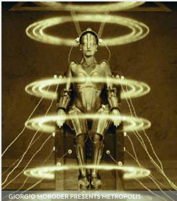
GIORGIO MORODER PRESENTS METROPOLIS