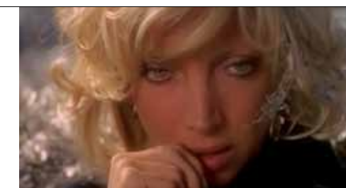
Swept Away (1974)