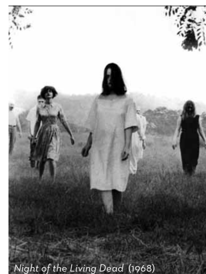
Night of the Living Dead (1968)

Fee: $200 for BMFI members, $225 for non-members