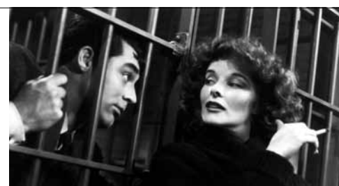
Bringing Up Baby (1938)

Class meets at BMFI: 4 Tuesdays, February 7, 14, 21, 28, 10:00 am to 1:00 pm