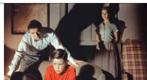
Bigger Than Life (1956)

Class meets at BMFI: 4 Tuesdays, February 7, 14, 21, 28, 6:30 pm to 9:30 pm